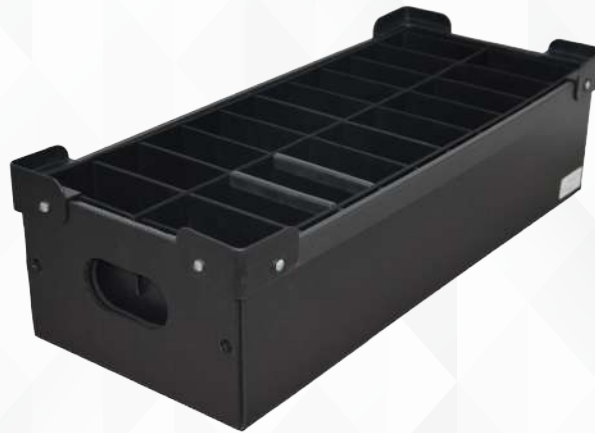
Stackable Conductive Bin with wire mesh dividers